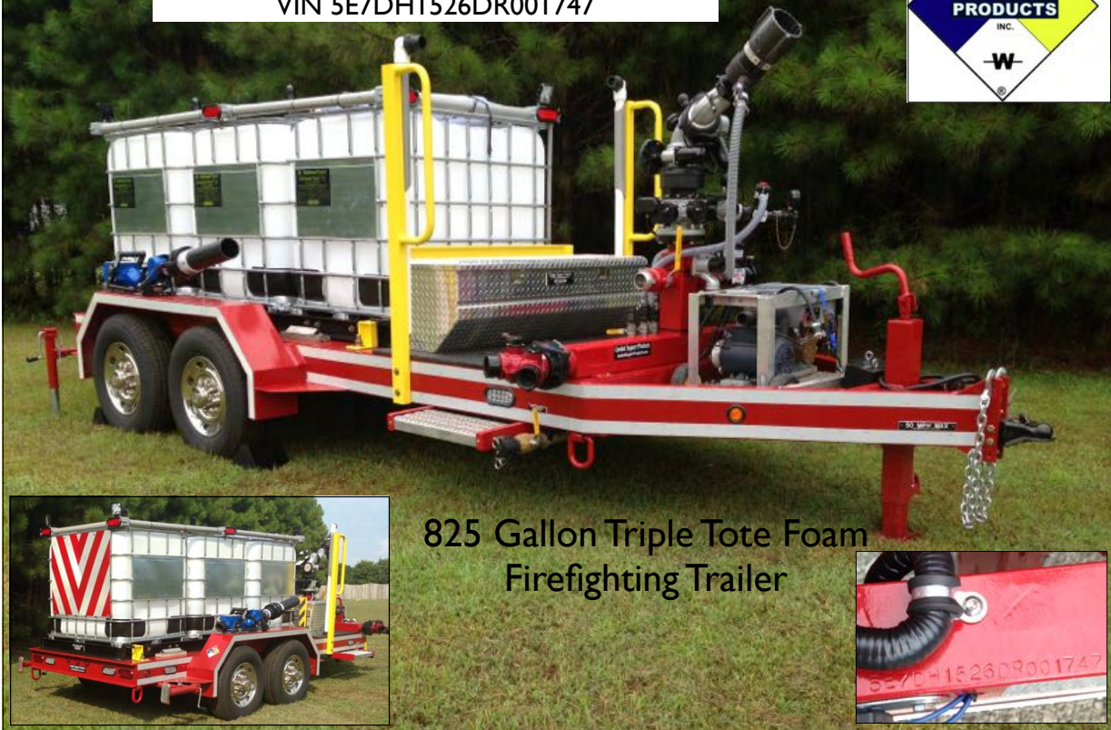
825 Gallon Triple Tote Foam Firefighting Trailer