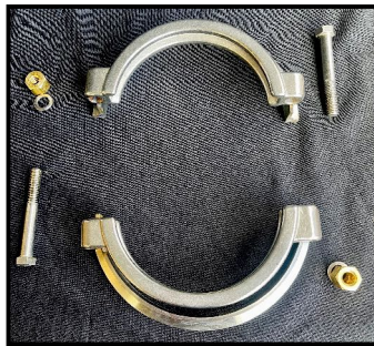
Separate mating ring segments.