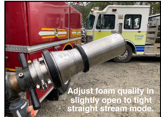
Adjust foam quality in slightly open to tight straight stream mode.