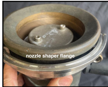
Fit mating ring segments behind nozzle shaper flange.