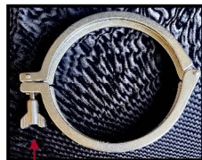
Attach nozzle flange to aerator flange. Capture both with hinged mounting collar. Snug tight thumb screw. If permanent, use blue lock tight on thumb screw threads.