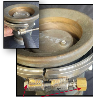
Hex stop - Only nut will turn.