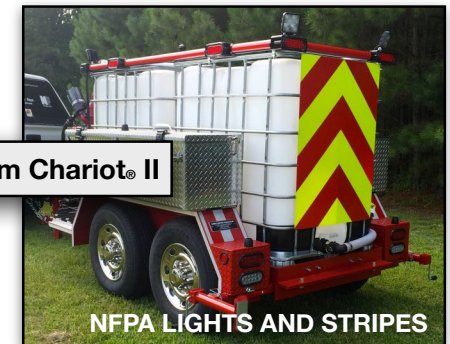
NFPA LIGHTS AND STRIPES