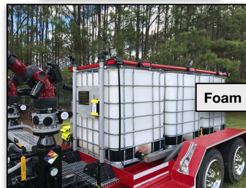
Foam Chariot® III