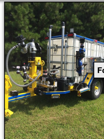
Foam Chariot® II