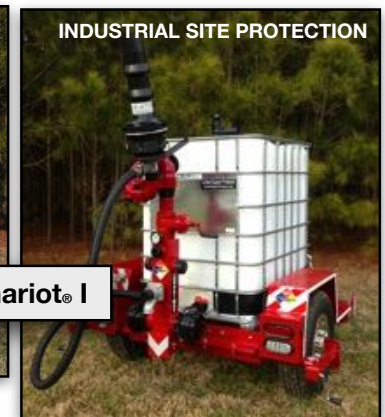
INDUSTRIAL SITE PROTECTION