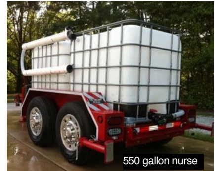
550 gallon nurse

275, 330, 550, 660 or 990 gallon FoamChariot nurse. Transfer pump only, no firefighting station,