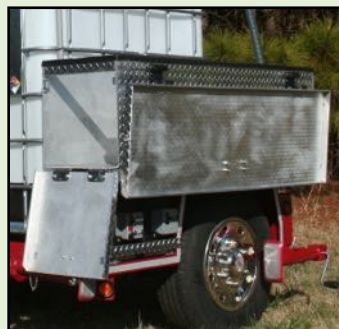
Two Door Hose/Storage