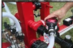
Dismounted, 300 ft. from FoamChariot's eductor.