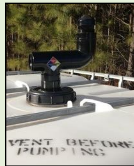
Auto Tank Vent