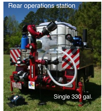
Single 330 gal.