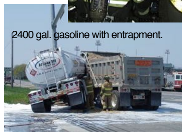
2400 gal. gasoline with entrapment.