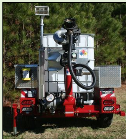
500 GPM RF Monitor