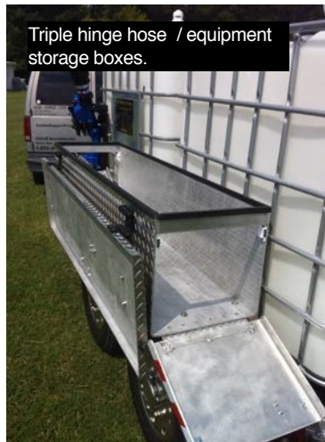
Triple hinge hose / equipment storage boxes.