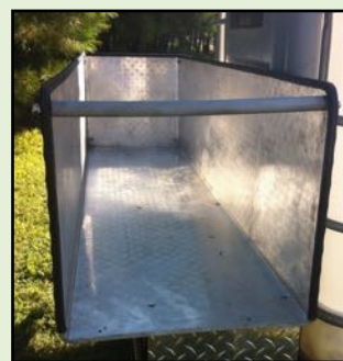
Open End Box 0.25" Plate