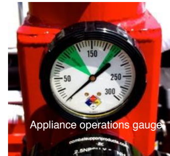
Appliance operations gauge

Manages a 3500 sq. ft. spill fire, or cover a leak.