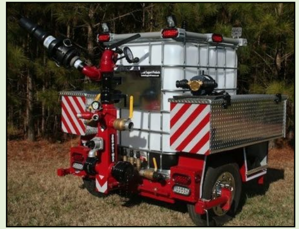
Radio Transfer Pump Kit