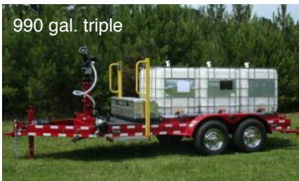
990 gal. triple