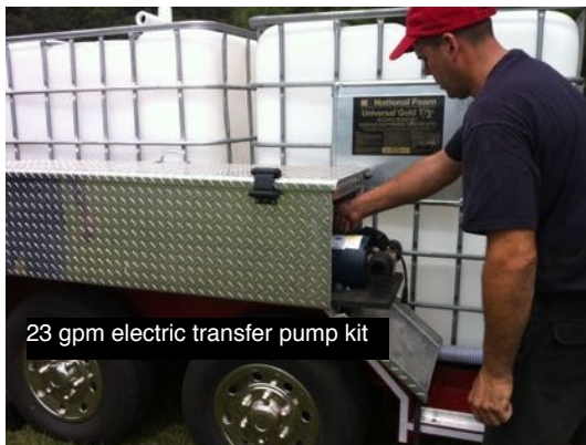
23 gpm electric transfer pump kit

275, 330, 550, 660 or 990 gallon FoamChariot nurse. Transfer pump only, no firefighting station,