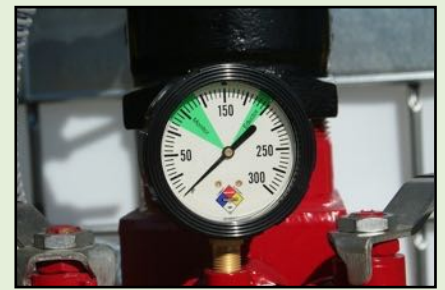
Appliance Ops. Gauges

FoamChariot ® I is a patent pending, compact, stable, self contained, rapid deployment asset, designed for firefighting and spill security where truckload or railcar quantities of ethanol and ethanol / gasoline blends are involved in fire or catastrophic spills. FoamChariot ® I is designed for fire departments having little storage space, limited towing capacity and tight budgets. FoamChariot ® I can be towed with a 1/2 ton pick-up or SUV and stores in a 6.5 ft. space with tow bar stowed under. FoamChariot ® I's consolidated frame and tote retaining scheme is key to this unit's compact, 6'.5" ft. storage footprint, which include: four point leveling and a single, 5000 lb. torsion axel with electric brakes. FoamChariot ® I is surprisingly stable and rated at highway speed, carrying 275 or 330 gal. of fluorine free alcohol resistant foam concentrate. Also available in dual-tote version.